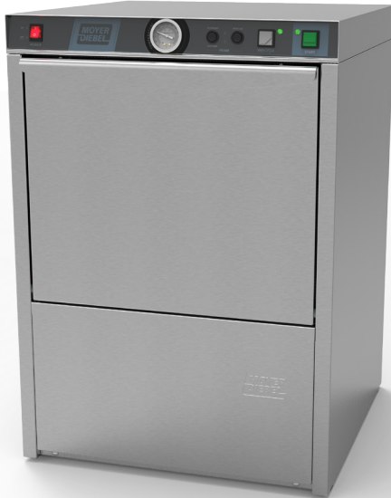
Shown with standard top and side panels.

Undercounter Low Temperature Dishwashing Machine